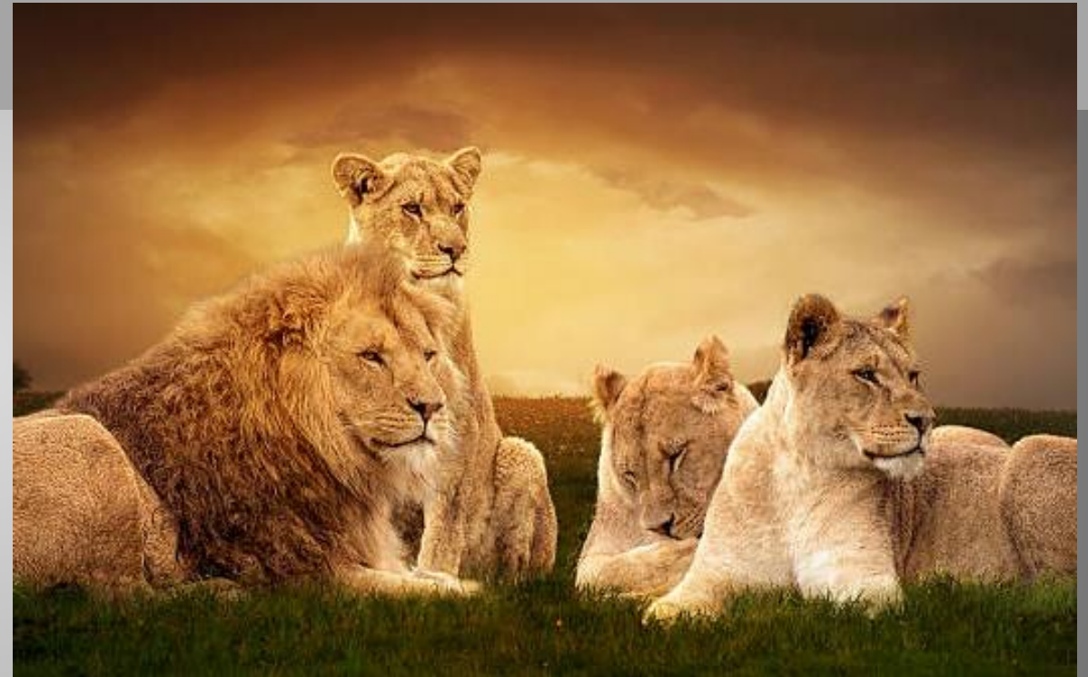
You are Lions