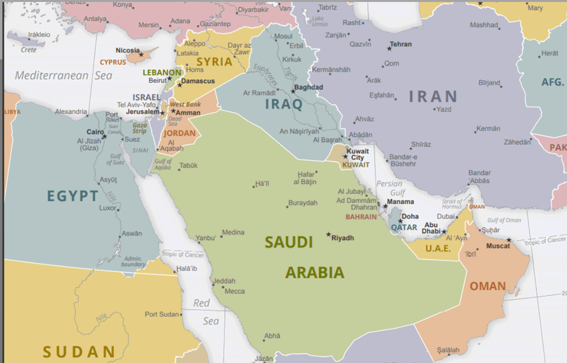
The Area Israel was to Possess: Joshua 1:4